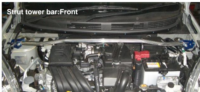
Strut tower bar:Front