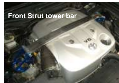
Front Strut tower bar