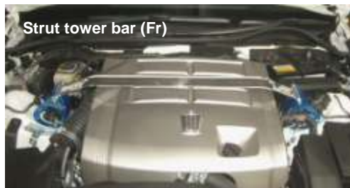
Strut tower bar (Fr)